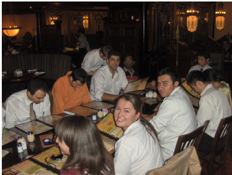
Fig. 3: CTIS-NUTC Student-Faculty-Alumni Group Photo 1

Figs. 3 and 4 illustrate representative images of the social and networking opportunity for the attendees.