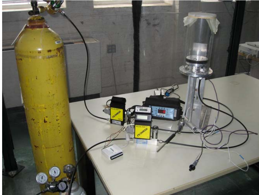
Figure 1. Experimental setup

Several improvements and considerations were taken into account during these experiments. Efforts were made to find the lower flammability limit that would be obtained in free space, including: