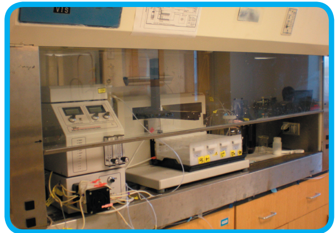
Tekran 2600 Series Ultra-Trace Mercury Analysis System

To meet the project objectives, investigators implemented the following steps: 1) Sample identification and initial characterization; 2) Equilibrium-based assessment of samples; 3) Mass transfer-based assessment of samples; 4) Identification of intrinsic leaching parameters for As and Se; 5) Identification of impacts of other factors on As and Se release.