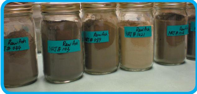
Fly ash samples for lab testing